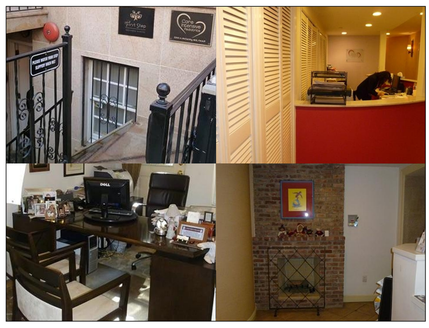
For Further Information, Please Contact