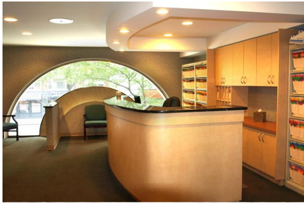
Reception / Waiting Area