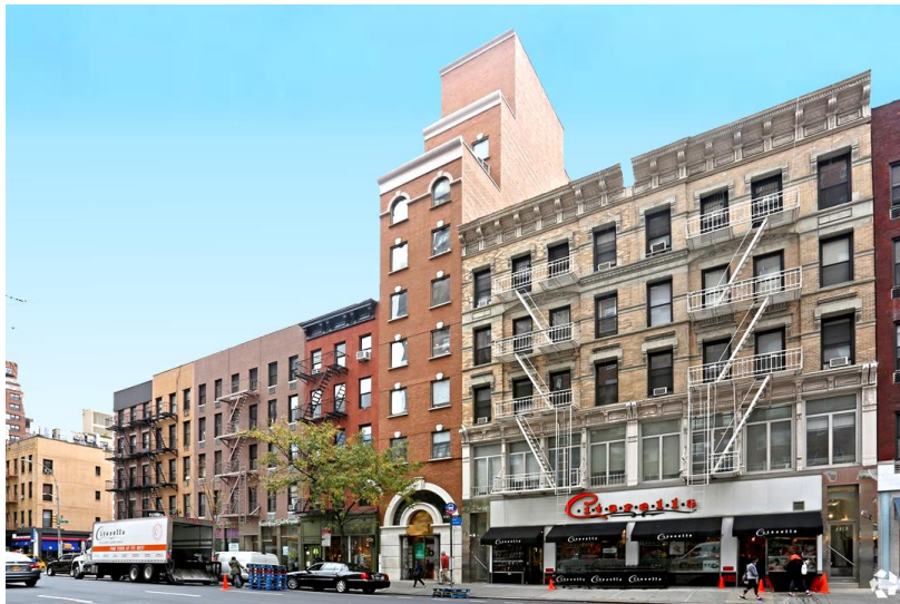
Building Property / Street