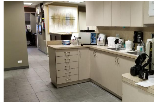
Lab / Sterilization Area