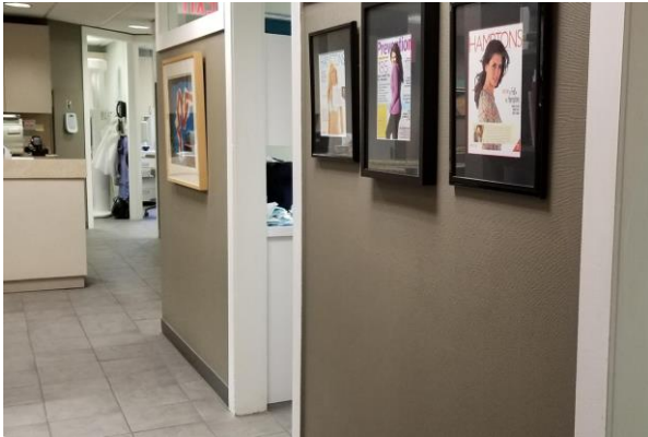
Walk Through / Hallway