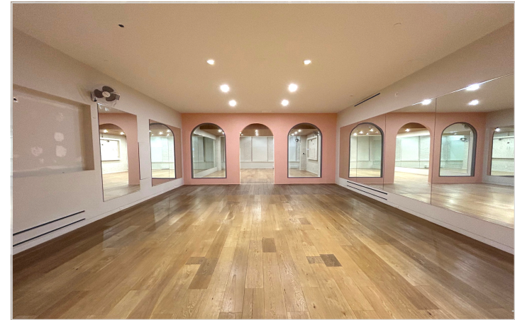
Front Open Area

Located on a premier and discreet block in the heart of Tribeca. The surrounding blocks are home to a variety of world-class cultural, dining, nightlife and exclusive luxury residential developments. 68 Thomas is also steps away to the Financial District and World Trade Center office market and walking distance to Battery Park City, Brookfield Place office and retail complex, Hudson River Greenway, riverfront parks, recreation areas and Soho.