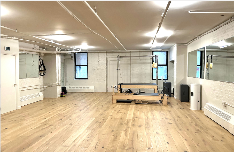
Lower Floor Open Area

FOR SALE OR FOR LEASE Ground Floor & Lower Level