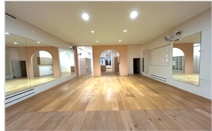
Rear Open Area - Outward