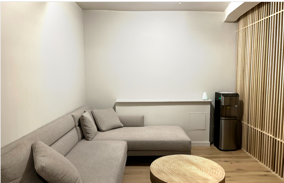
Lower Floor Lounge