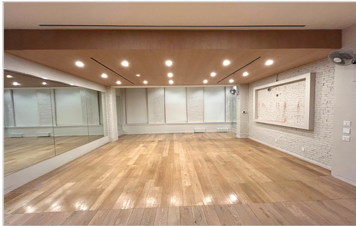
Rear Open Area - Inward