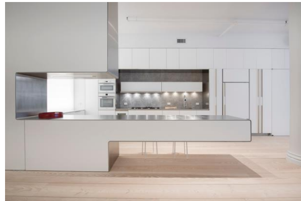
Kitchen + Coffee Bar